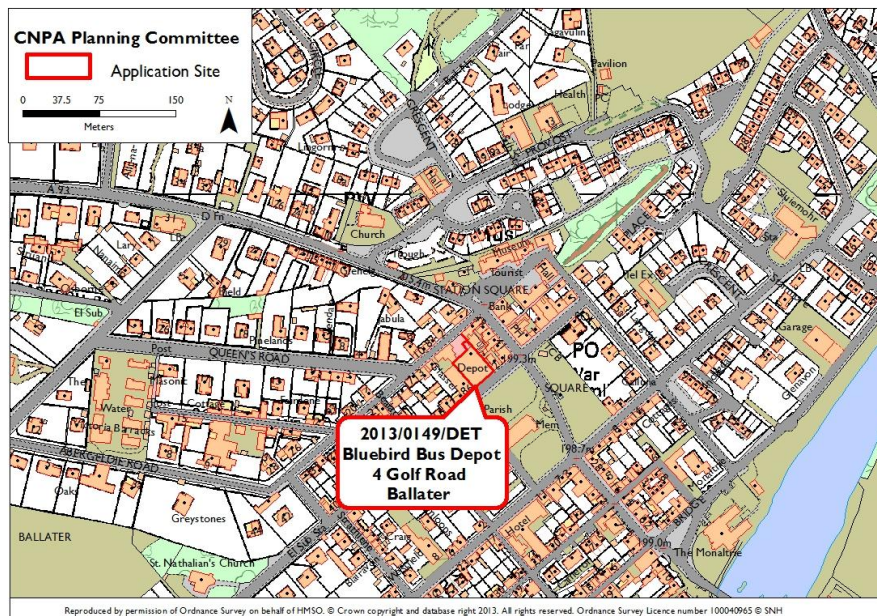
Grid reference: 336944, 795830 Fig. 1 - Location Plan

RECOMMENDATION: APPROVAL SUBJECT TO CONDITIONS