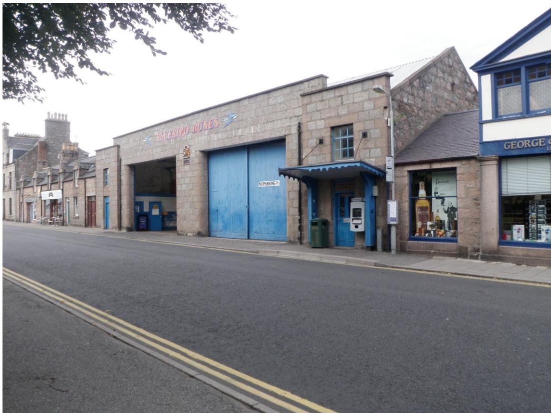
Fig 2: Photo of existing Golf Road Elevation